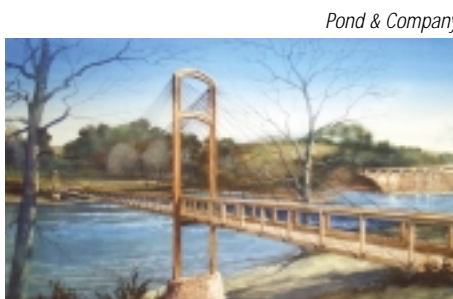
A pedestrian bridge could span the Chattahoochee River linking park land in Fulton County and Cobb County.

public and recreational amenities on Morgan Falls Road. Proposed enhancements along Morgan Falls